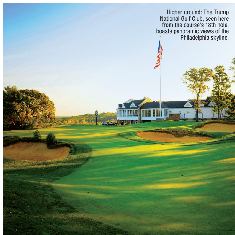
Higher ground: The Trump National Golf Club, seen here from the course's 18th hole, boasts panoramic views of the Philadelphia skyline.