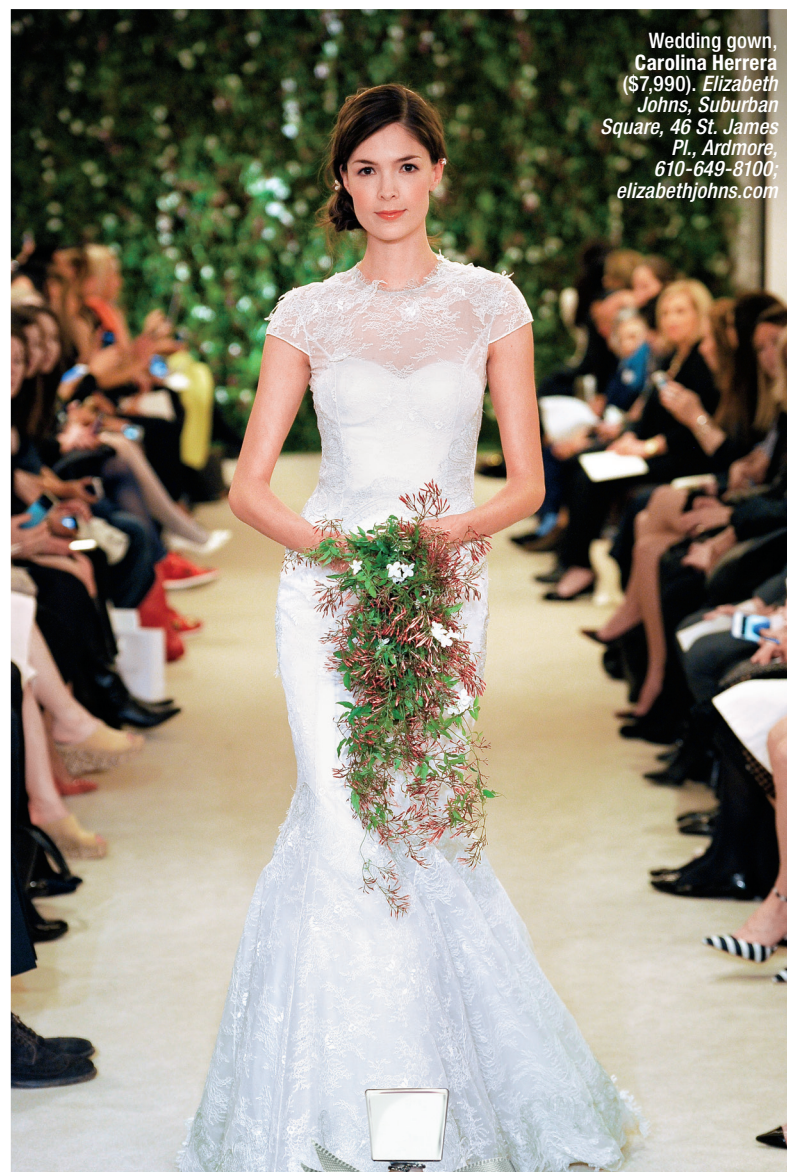
Wedding gown, Carolina Herrera ($7,990). Elizabeth Johns, Suburban Square, 46 St. James Pl., Ardmore, 610-649-8100; elizabethjohns.com