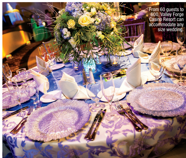
From 60 guests to 600, Valley Forge Casino Resort can accommodate any size wedding.