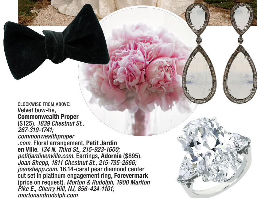
CLOCKWISE FROM ABOVE: Velvet bow-tie, Commonwealth Proper ($125). 1839 Chestnut St., 267-319-1741; commonwealthproper.com. Floral arrangement, Petit Jardin en Ville. 134 N. Third St., 215-923-1600; petitjardinenville.com. Earrings, Adornia ($895). Joan Shepp, 1811 Chestnut St., 215-735-2666; joanshepp.com. 16.14-carat pear diamond center cut set in platinum engagement ring, Forevermark (price on request). Morton & Rudolph, 1900 Marlton Pike E., Cherry Hill, NJ, 856-424-1101; mortonandrudolph.com

“LIGHTING WILL PLAY A HUGE PART IN THE VIBE YOU’RE GOING FOR.”