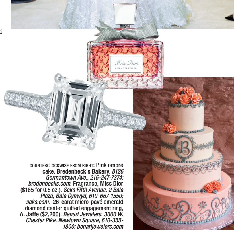
COUNTERCLOCKWISE FROM RIGHT: Pink ombré cake, Bredenbeck's Bakery , 8126 Germantown Ave., 215-247-7374; bredenbecks.com . Fragrance, Miss Dior ($185 for 0.5 oz.). Saks Fifth Avenue , 2 Bala Plaza, Bala Cynwyd, 610-667-1550; saks.com . .26-carat micro-pavé emerald diamond center quilted engagement ring, A. Jaffe ($2,200). Benari Jewelers , 3606 W. Chester Pike, Newtown Square, 610-355-1800; benarijewelers.com

PHOTOGRAPHY COURTESY OF CAROLINA HERRERA (GOWN)