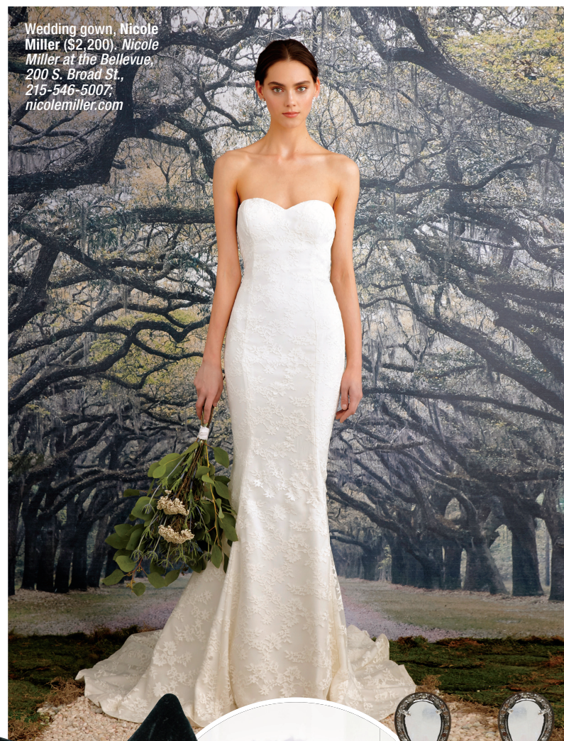
Wedding gown, Nicole Miller ($2,200). Nicole Miller at the Bellevue, 200 S. Broad St., 215-546-5007; nicolemiller.com