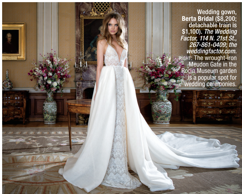
Wedding gown, Berta Bridal ($8,200; detachable train is $1,100). The Wedding Factor , 114 N. 21st St., 267-861-0409; the weddingfactor.com. RIGHT: The wrought-iron Meudon Gate in the Rodin Museum garden is a popular spot for wedding ceremonies.